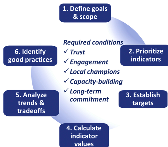
Fig. 2. Approach to engaging stakeholders for improving landscape management (simplified version adapted from Dale et al., 2019).

We applied an established framework for selecting and prioritizing indicators (e.g., Dale et al., 2019) designed to (1) identify key indicators appropriate for the context, (2) provide adequate information relative to the cost of obtaining it, (3) build agreement around stakeholders’ goals for desired future conditions, (4) consider important stakeholder concerns, and (5) identify a suite of indicators