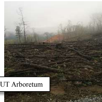
Wood left after clear cutting at UT Arboretum